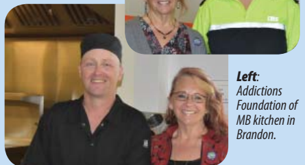
Left: Addictions Foundation of MB kitchen in Brandon.