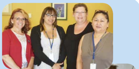
Above: The Pas Primary Health Clinic Right: EMS station in Swan River.

As part of Public Service Week celebrations, I was proud to attend the 18th Annual MB Service Excellence Awards, which are sponsored by the MGEU. Nearly 300 people were nominated for their efforts and distinction in workplace performance! Congratulations to all.