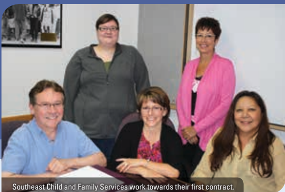
Southeast Child and Family Services work towards their first contract.