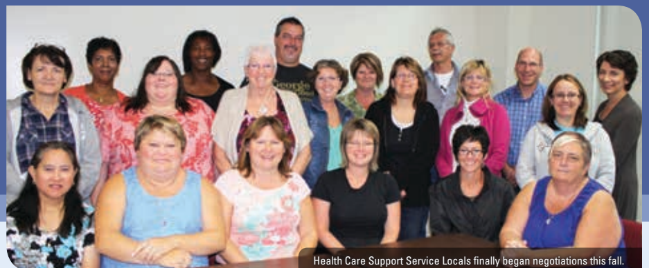
Health Care Support Service Locals finally began negotiations this fall.