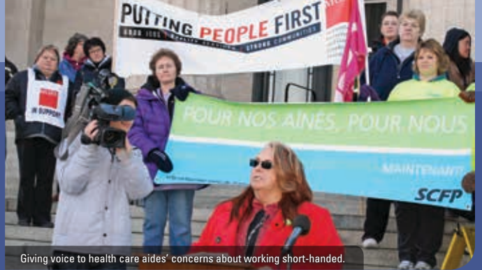
Giving voice to health care aides' concerns about working short-handed.