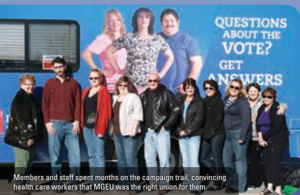
Members and staff spent months on the campaign trail, convincing health care workers that MGEU was the right union for them.