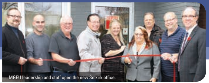
MGEU leadership and staff open the new Selkirk office.