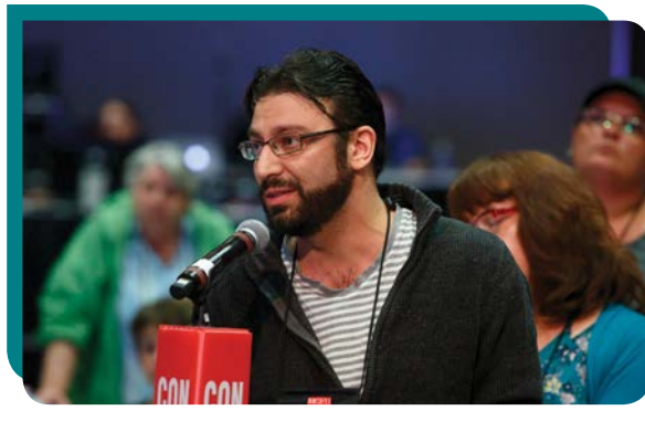
ABOVE 53% of delegates were first-time attendees of the MGEU Convention