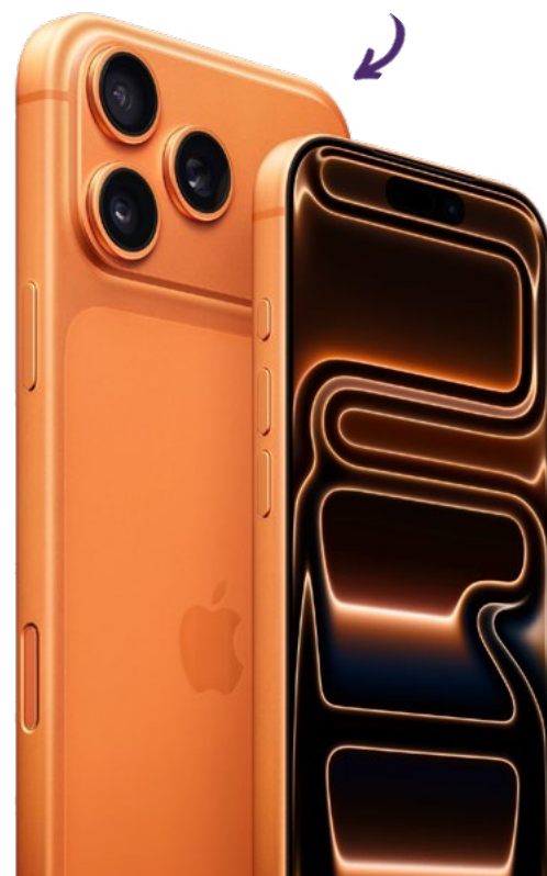
iPhone 17 Pro

Choose from our 5G Standard plans for essential connectivity, or go all-in with 5G+ Complete Explore - enjoy seamless global roaming in 68 destinations and our 5-Year Rate Plan Price Lock. Use your own device or pick a new phone to get started.